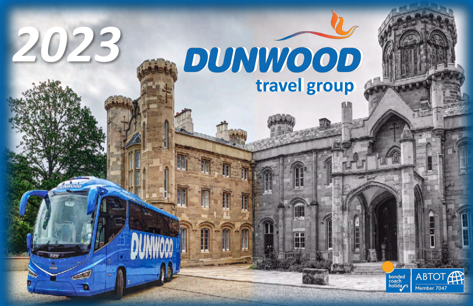
Fully Bonded UK & European Holidays For Your Total Peace Of Mind